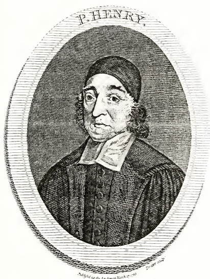
From an engraved Picture in the possession of Nicholas Le Novain Esq. Worcester 1743